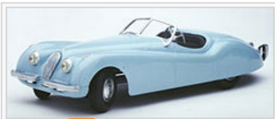
A diecast 1:10 scale Doepke Toys Jaguar XK120 from 1955. One of two car models the company made, this model is 17.5 in (440 mm) long. (in The Children's Museum of Indianapolis)